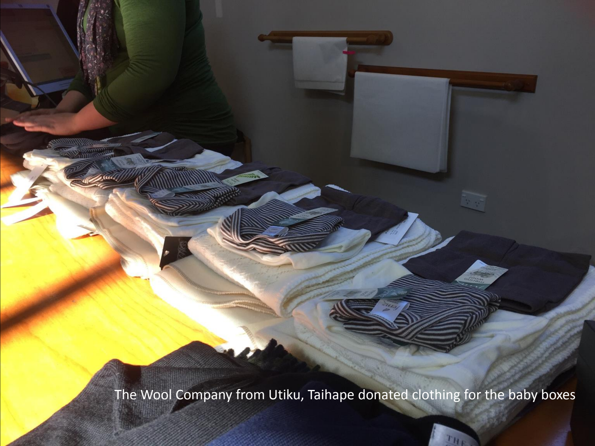
The Wool Company from Utiku, Taihape donated clothing for the baby boxes