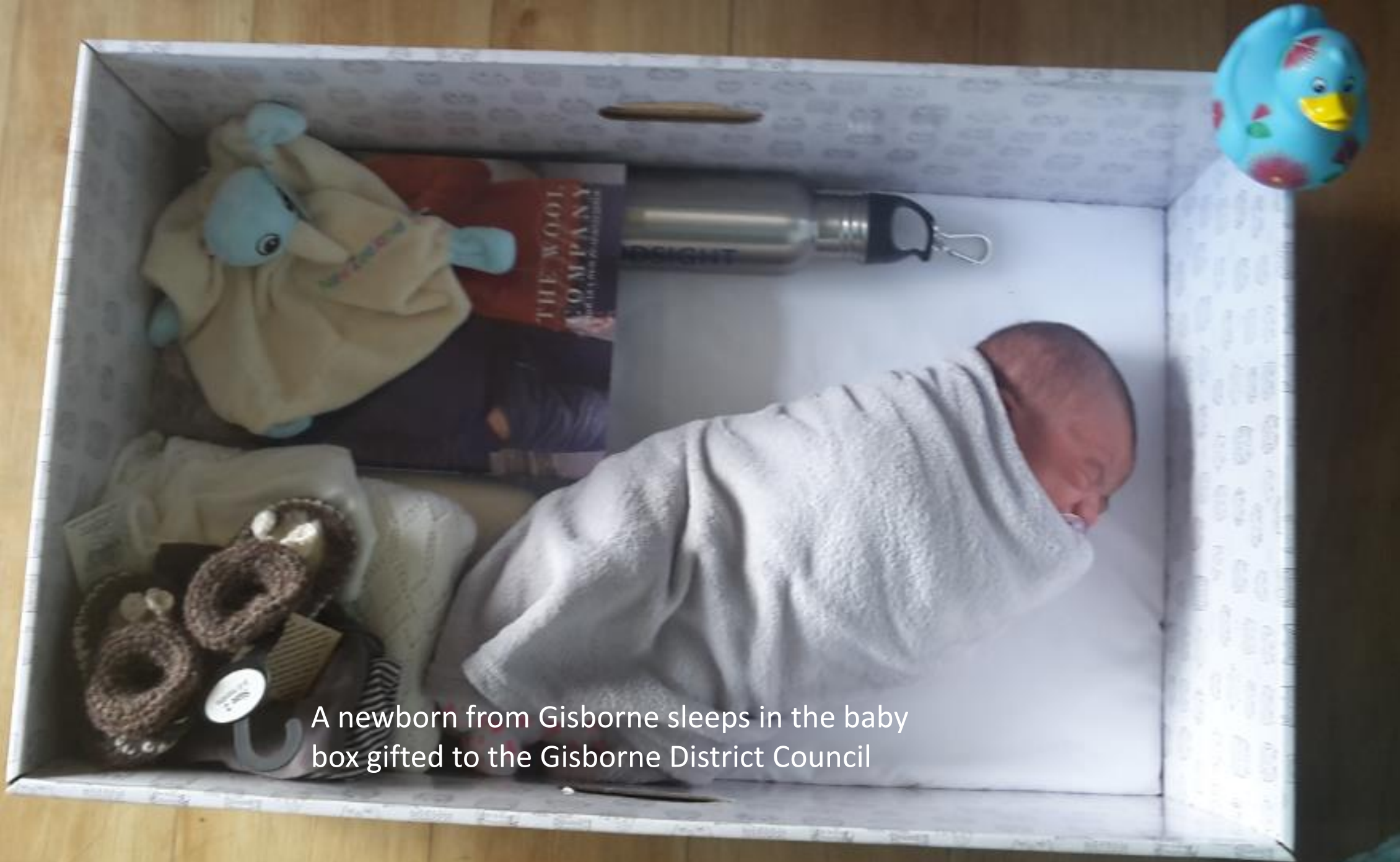
A newborn from Gisborne sleeps in the baby box gifted to the Gisborne District Council