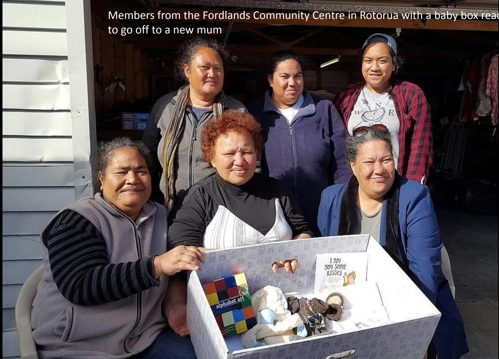
Members from the Fordlands Community Centre in Rotorua with a baby box ready to go off to a new mum