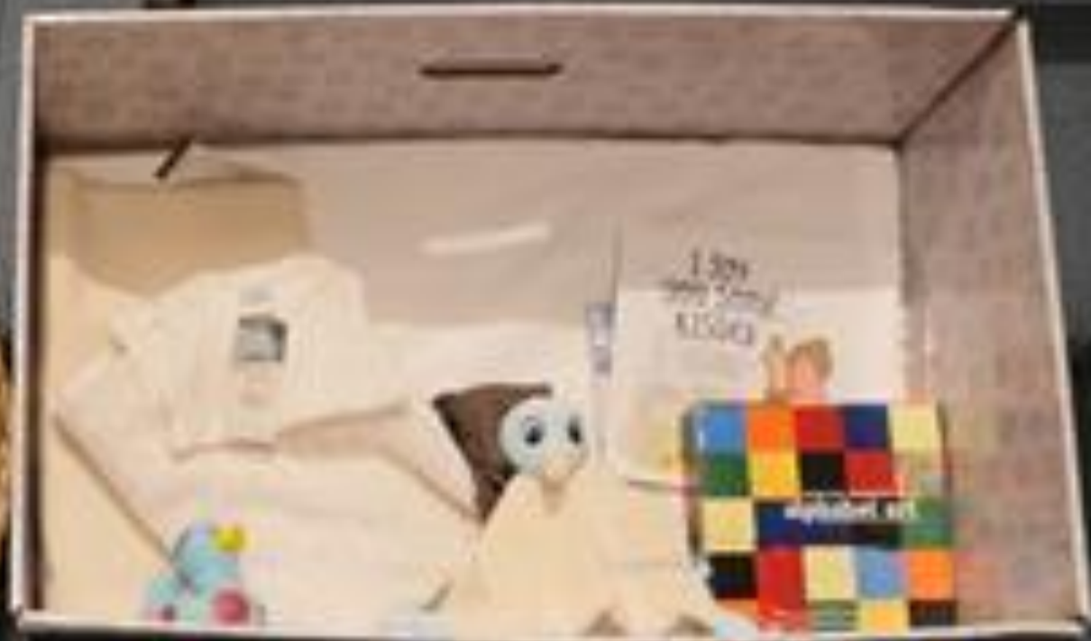
Pepi pod and baby box side by side