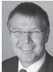
Hon David Parker Minister Responsible for Climate Change Issues