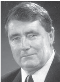
Hon Jim Anderton Minister of Forestry

Climate change is probably the greatest environmental threat facing humanity. No part of New Zealand society will be immune, but our land-based sectors are particularly affected. We look forward to establishing effective and durable partnerships with all those groups with an interest in meeting the climate change challenge.