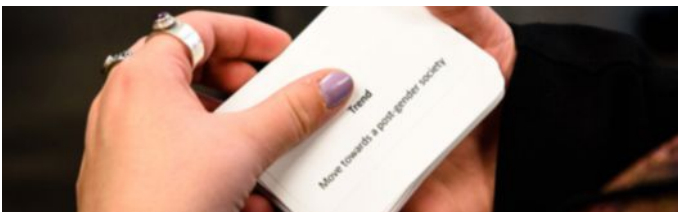
Figure 1. ForesightNZ: A playing card

Related to this is the idea of 'family learning'. Modern family structures require all genders to be involved in parenting and management of family affairs, and the curriculum should reflect this. Hence the tertiary education system must be both gender-neutral and flexible to the needs of all students and their families.