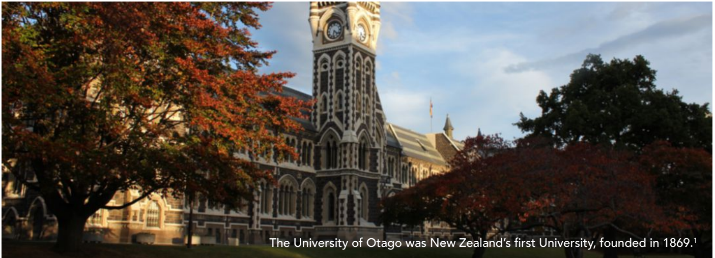
The University of Otago was New Zealand's first University, founded in 1869. 1