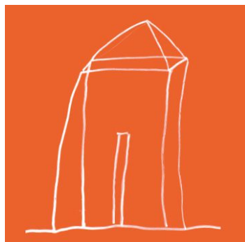
Figure 4. TacklingPovertyNZ : The Glass House 9

A healthy home represents our vision for New Zealand in the future, but we see poverty in the present as a glass house. Those inside can see out to where they want to be, but are constrained and suppressed by the cold glass. The glass house is fragile and vulnerable to the slightest change. It is very easy to see the frustration of the people inside the glass house, but it is not easy to hear their voices, which means that they are often wrongly stigmatised and blamed. But the glass house does not have to be a trap. With the right support and opportunities in place, those inside can be empowered to escape. We want to build a better future for New Zealanders—a healthy home that nurtures its inhabitants, allows them to thrive, and spurs them to move outwards and upwards in the world. 8