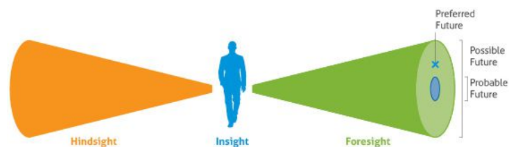
Figure 5. StrategyNZ : Illustrating an understanding of future studies 11

Moving from STEM (Science, Technology, Engineering and Maths) to STEAM (the addition of Arts) is something that is already happening. If we want fresh ideas, we need to create spaces where a diverse range of people can come together to solve complex problems and develop new ways of doing things.