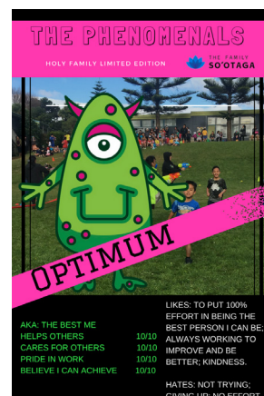
The Phenomenal monster posters are placed throughout the school to remind students of their attributes.