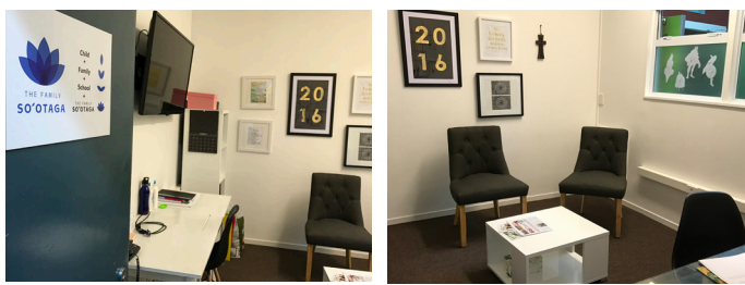
Inside the So'otaga meeting room.