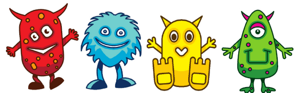
The Phenomenal monsters: ICAN, Grit, Mafana and Optimum.

'We've found So'otaga has given us the confidence to be able to speak to teachers openly and freely.'