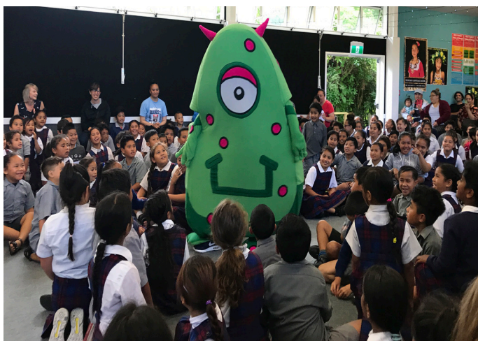
The Phenomenal monster 'Optimum' meets Holy Family students at a So'otaga assembly.