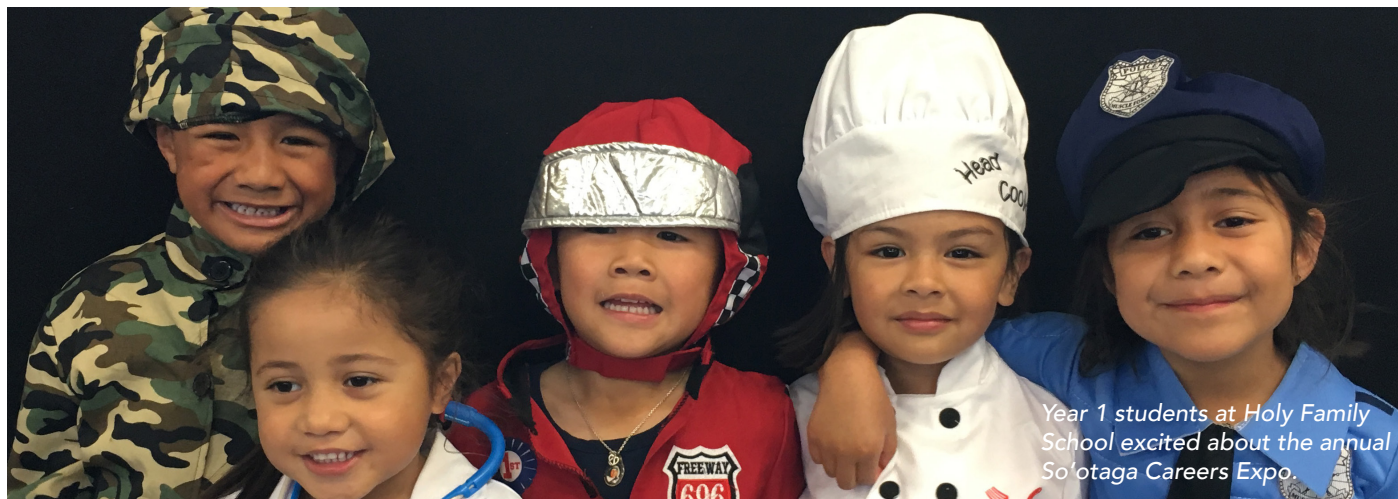
Year 1 students at Holy Family School excited about the annual So'otaga Careers Expo.