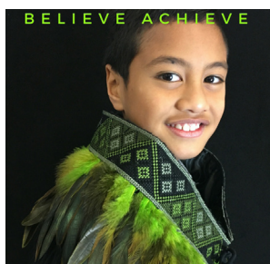
Holy Family School placed a focus on the phrase 'Believe; Achieve' as part of So'otaga during 2017, to encourage students to believe they will achieve.

(collectively called The Phenomenals each has a name and a particular trait. Current monsters are Grit, ICAN, Optimum and Mafana (a Samoan word for warmth and care).