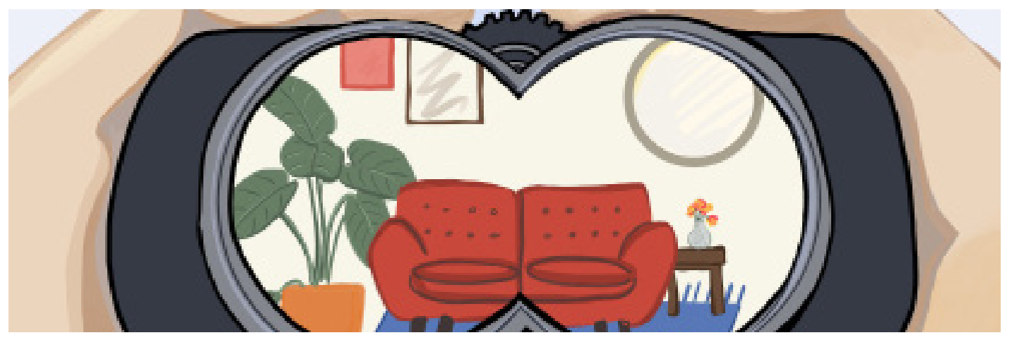
While our immediate future might seem confined to the comforts of our own living rooms, you might like to spend some time looking forward. Illustration by Becky Jenkins – McGuinness Institute.