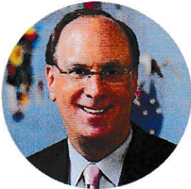
Larry Fink Chairman and Chief Executive Officer