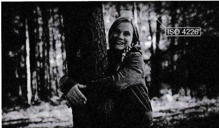
ISO and the environment

The ISO 14000 family of standards are developed by ISO Technical Committee ISO/TC 207 and its various subcommittees. For a full list of published standards in the series see their standards catalogue .