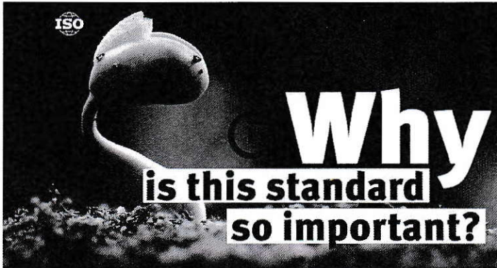
New edition of ISO 14000

There are more than 300,000 certifications to ISO 14001 in 171 countries around the world. Learn more about the ISO Survey of Certifications.