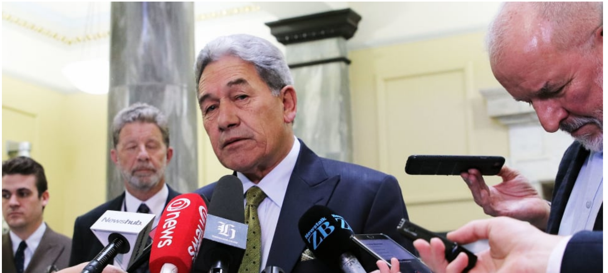
Winston Peters' party fundraising faces a Serious Fraud Office inquiry.