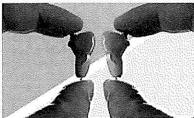
Warning to Over 50s Who Haven't Had A Hearing Check Yet Clinic Compare