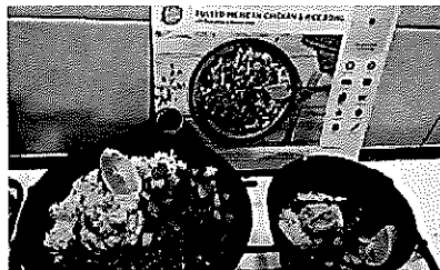
We Tried HelloFresh: Here's What Happened Topdust