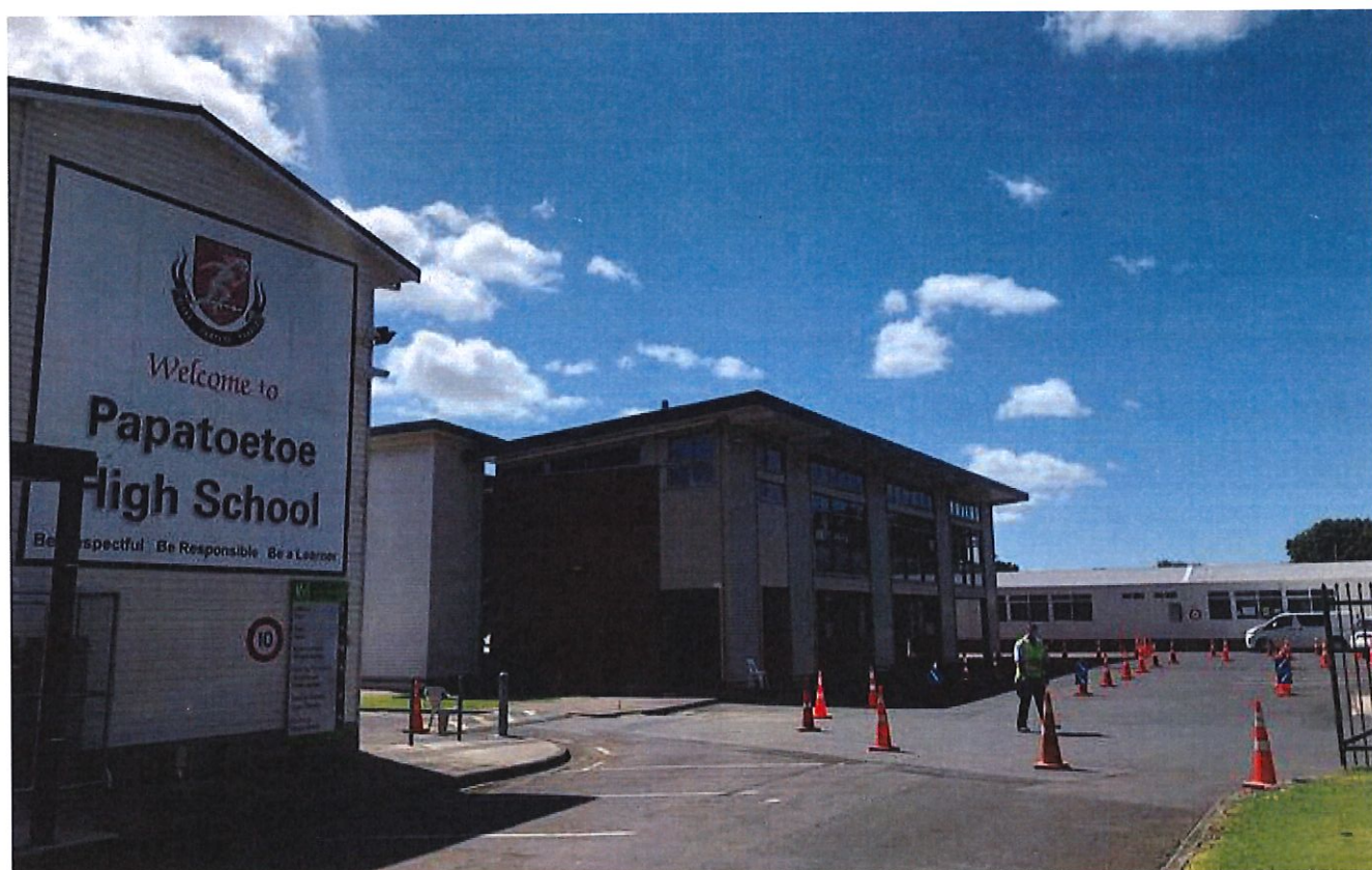
Papatoetoe High School remains closed as health authorities take the Covid-19 outbreak in the suburb.

Case G was reported on 19 February. Case H was reported on 22 February, having returned an earlier negative result, but had been in quarantine as a precaution since the 19th and in isolation since the 15th.