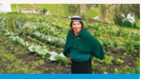
Photo captions: Left: Women working in the rice fields, Lao PDR. Right: A Peruvian woman in front of her family's crops.