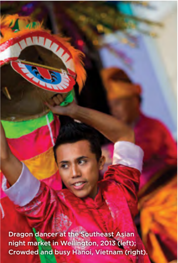
Dragon dancer at the Southeast Asian night market in Wellington, 2013 (left); Crowded and busy Hanoi, Vietnam (right).