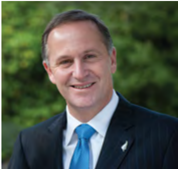
Rt Hon John Key Prime Minister

I am pleased to introduce this NZ Inc Strategy as it sets out a framework for moving our relationship with ASEAN to the next level.