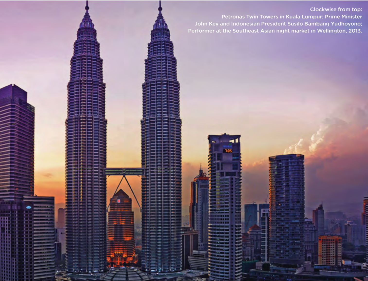
Clockwise from top: Petronas Twin Towers in Kuala Lumpur; Prime Minister John Key and Indonesian President Susilo Bambang Yudhoyono; Performer at the Southeast Asian night market in Wellington, 2013.