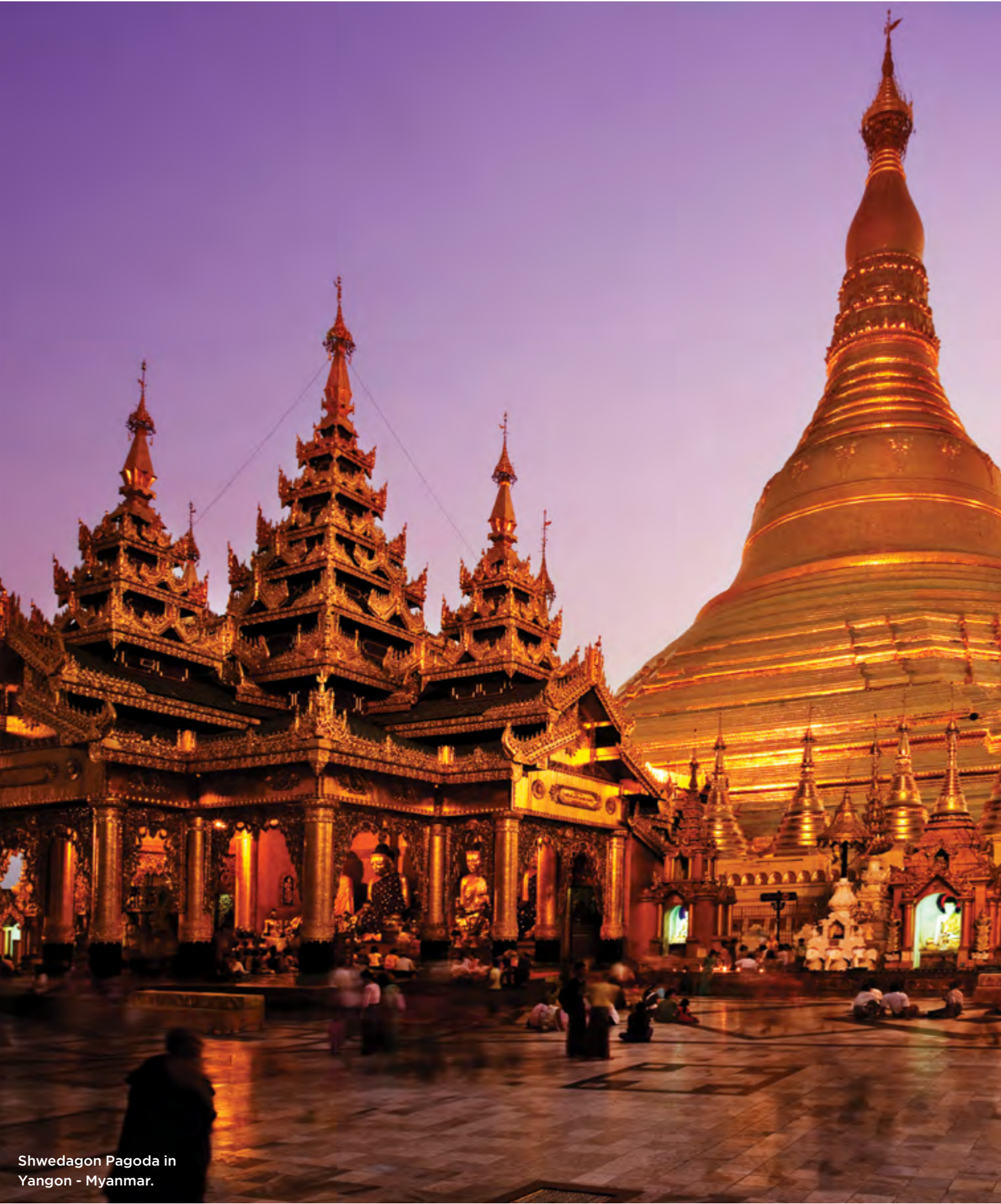
Shwedagon Pagoda in Yangon - Myanmar.