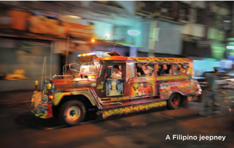
A Filipino jeepney

Achieving the Strategy’s goals will require a change of thinking among many New Zealand businesses. The challenge begins with raising awareness across the community of ASEAN’s importance both in our midst and as a threshold to New Zealand’s future prosperity. This Strategy pushes the boat out into a sea of opportunity – and invites New Zealanders on board.