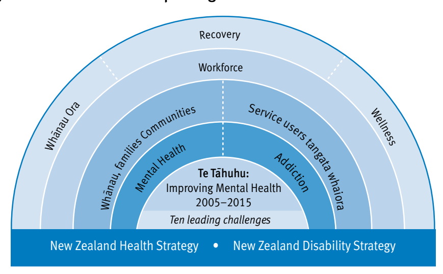
Figure 1: Te Tāhuhu – Improving Mental Health

Te Tāhuhu broadens the Government's interest in mental health, expanding to cover not only people who are severely affected by mental illness but all New Zealanders, and draws together government interests in mental health and addiction (see Figure 1). The 10 leading challenges articulated in Te Tāhuhu provide the platform for advancing whānau ora and recovery for tangata whaiora.