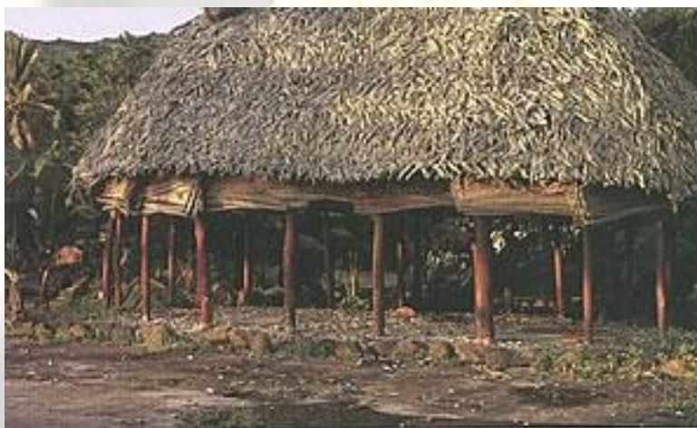
The fale represents the Pacific family with strong foundations

Through the Talanoa process the nature, role and appropriateness of each platform has been debated and the activity strands which deliver on them extensively work-shopped. This has resulted in the final draft receiving both the endorsement and buy-in of the External Reference Group.