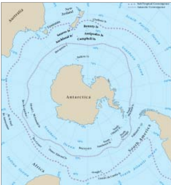
Fig. 1: The location of New Zealand's Subantarctic islands in relation to the subtropical and Antarctic convergences as well as the other Subantarctic island provinces.

Because of their origins and isolation from major land masses, their climate, topography and relationship to marine topography, the New Zealand Subantarctic islands have developed unique ecosystems with a high degree of endemism. Human influence on these islands is very recent although profound for some islands and species.