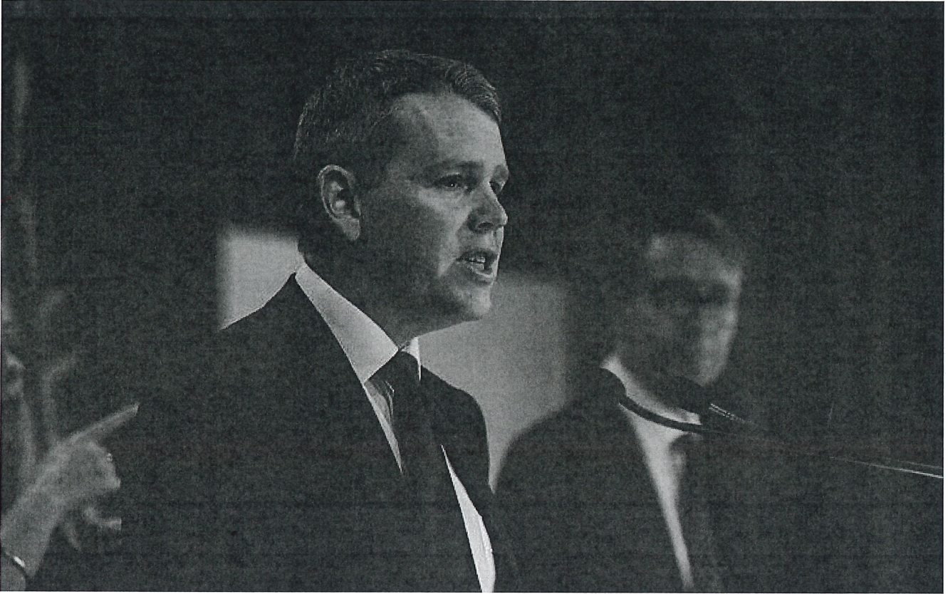
Minister for Covid-19 Response Chris Hipkins and Director-General of Health Dr Ashley Bloomfield

Scenario planning also includes someone testing positive after they had travelled home from a music festival and investigations finding no clear link to the border.