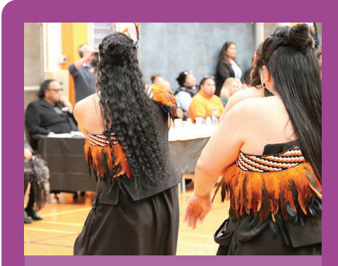
Whakataetae kapa haka at ARWCF. ARWCF placed second overall in the competition