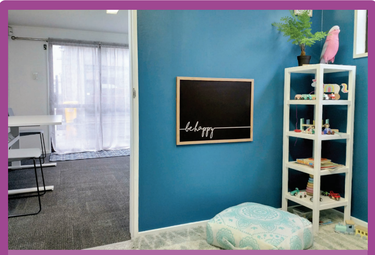
Te Mana Wāhine builds on the work already happening to make spaces more welcoming for children and whānau. The whānau room at Rangiora Community Corrections (pictured) is an example of a safe, friendly space created for children to play while their mothers meet with staff.