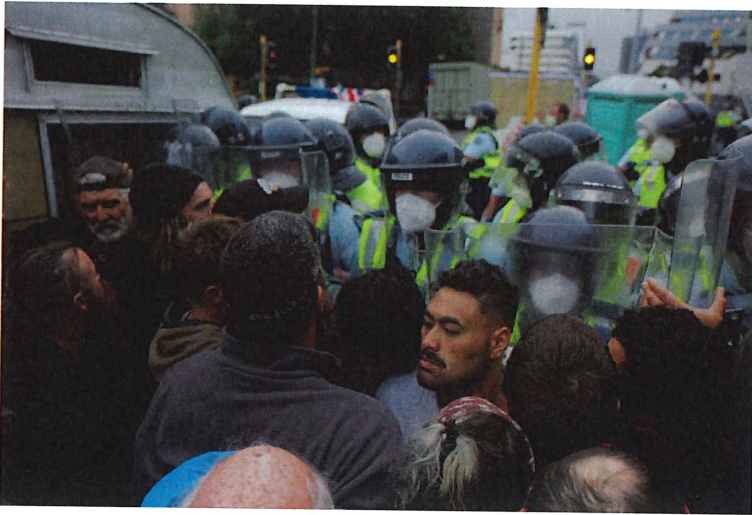
Police undertake an early morning operation to restore order and access to the area around Parliament.

As daylight set in, a clash between protesters and police followed.