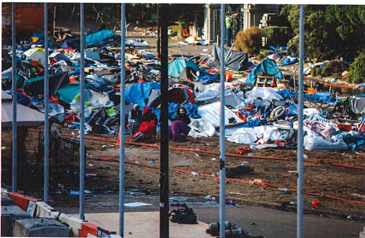
Rubbish left behind at the Parliament protest site.

A small number of protesters remained near the Victoria University Pipitea campus.