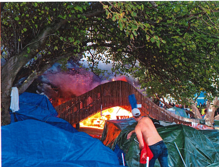
A fire at Parliament grounds.

Shortly after, police gained more ground including the Beehive forecourt and then began using fire hoses to spray protesters.