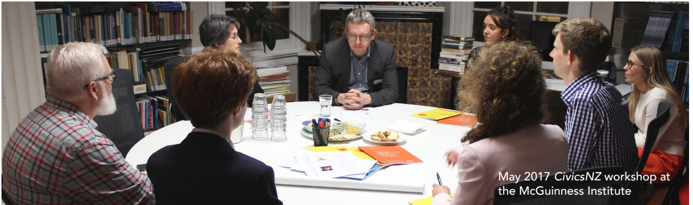
May 2017 CivicsNZ workshop at the McGuinness Institute