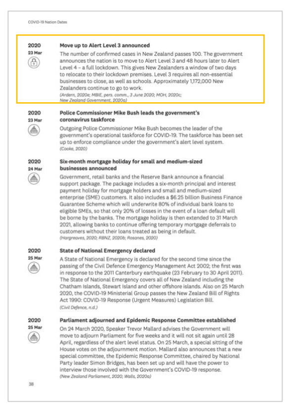
Move up to Alert Level 3 announced, COVID-19 Nation Dates , p. 38

Beehive Post-Cabinet Press Conference: 23 March 2020: <u>Transcript of press conference</u> Radio New Zealand: 23 March 2020: <u>Video</u>