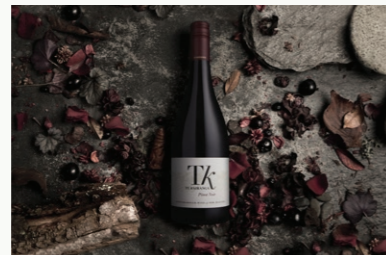
Te Kairanga Martinborough