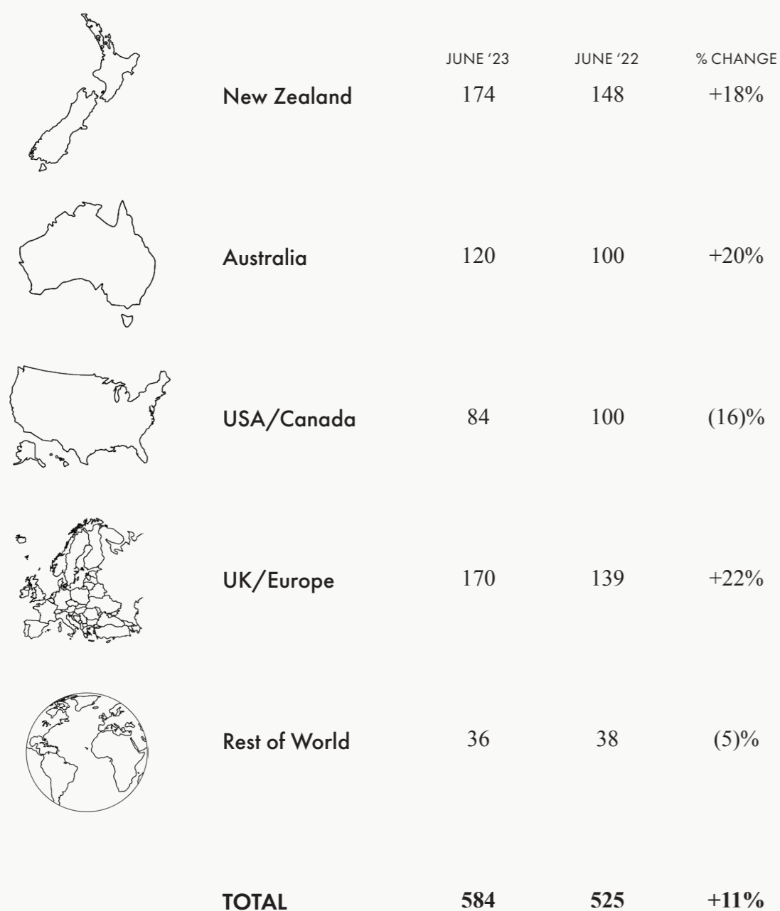
BOTTLED CASE SALES (000'S) 12 MONTHS TO JUNE

This year our unrealised gains/(loss) on harvested grapes has been negatively impacted by the Central Otago region. We produce grapes for high value wines, which means a higher cost associated with the grapes due to the viticultural practices applied. However the market price of grapes in that region is often reflective of more commercial wines at lower price points. Therefore this reflects in a loss, which is then reversed out when sold.