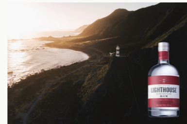
Lighthouse Gin Martinborough