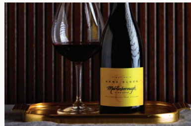
Martinborough Vineyard Martinborough

The 2023 year was a record for the Company and reflected the work done in building the brands, the continued focus on producing high quality wine and building quality routes to market. At the same time the Company completed major capital expenditure programmes that will lead to the ability to process more wine with the Grove Mill winery capacity increased to 4,000 tonnes, the completion of The Runholder (Martinborough development) and significant investment in both vineyard productivity and capacity.