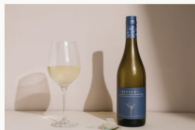
Grove Mill Wairau Valley, Marlborough