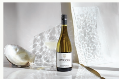
Vavasour Awatere Valley, Marlborough