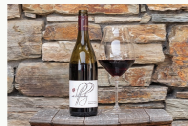
Mt Difficulty Central Otago