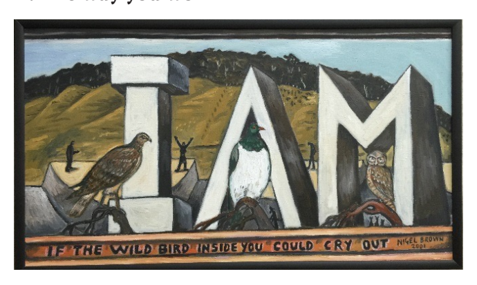
Image 1: Nigel Brown, A picture of three wild birds that share the landscape at the bottom of the South Island, 2001