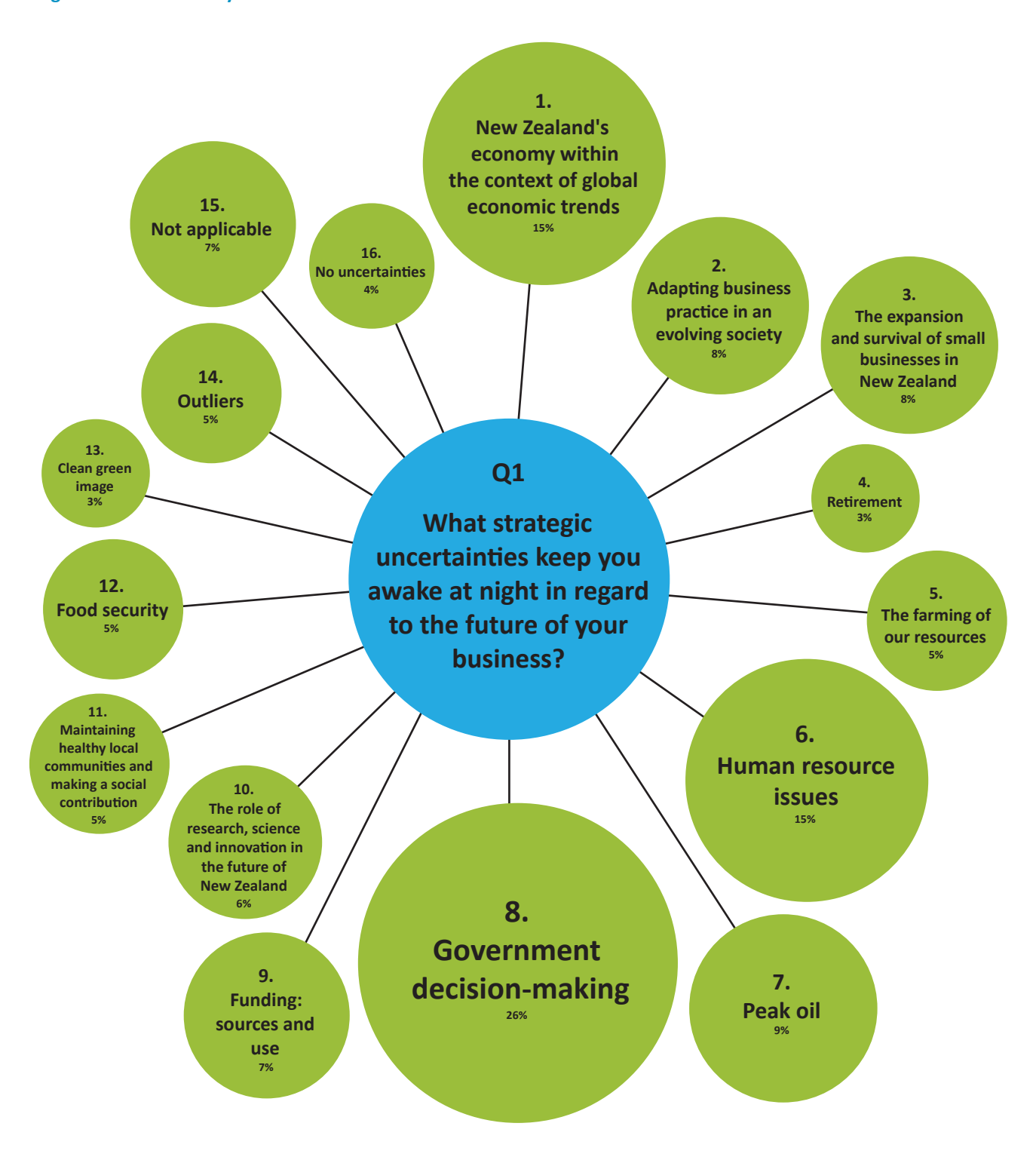
Figure 1 Themes that emerged in response to Question 1: What strategic uncertainties keep you awake at night in regard to the future of your business?

down of the responses which provides a more indepth understanding of the strategic uncertainties identified in the survey.