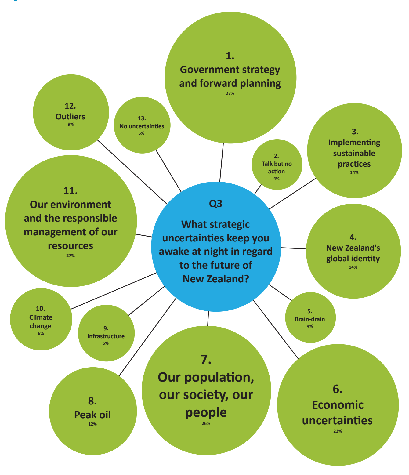
Figure 3 Themes that emerged in response to Question 3: What strategic uncertainties keep you awake at night in regard to the future New Zealand?

down of the responses which provides a more indepth understanding of the strategic uncertainties identified in the survey.