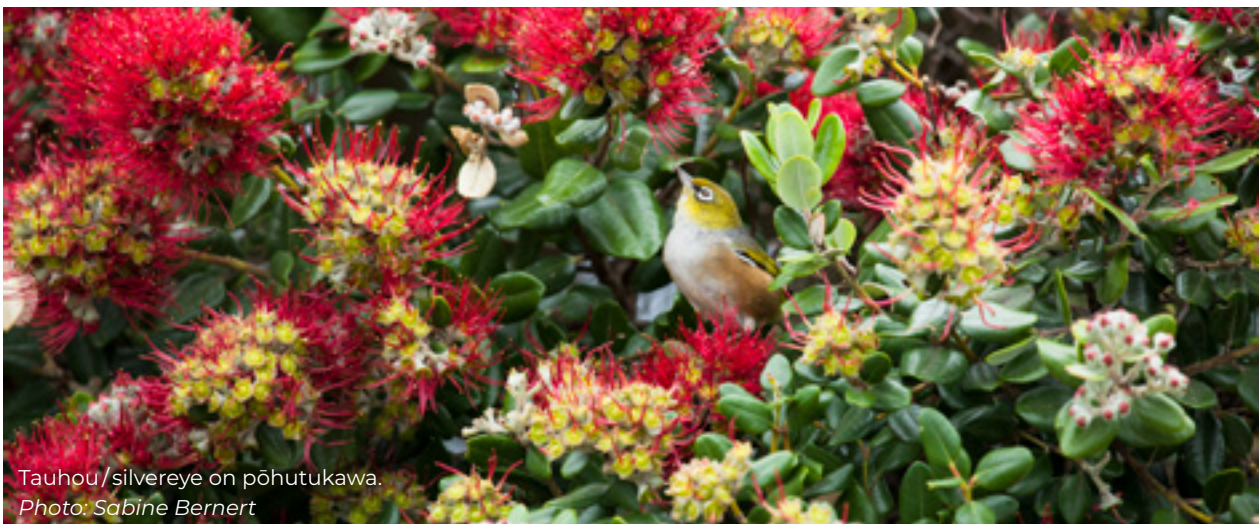
Tauhō/silvereye on pōhutukawa.

Having cross-agency agreement would ensure that efforts across the sector are focused on the most important work for biodiversity. There would be benefit in extending this prioritisation to include other pressures, including abiotic pressures such as sedimentation, along with approaches to recovering native species and implementing nature-based solutions to climate change.