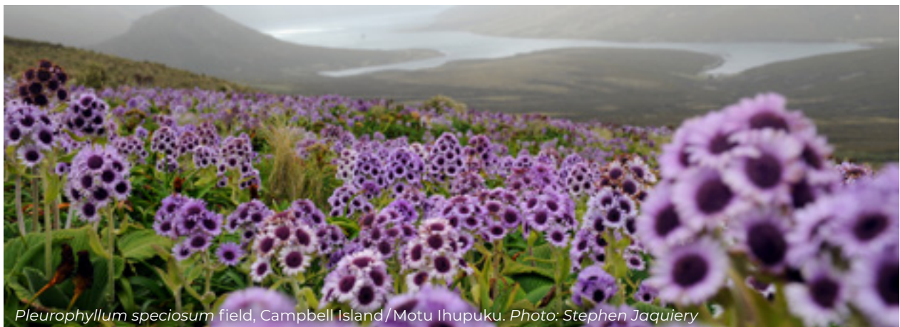
Pleurophyllum speciosum field, Campbell Island / Motu Ihupuku.

While New Zealand's biodiversity challenge is significant, we know that where we act, we can make a difference. We have proven in many parts of the country that when we remove or manage pressures, restore habitats and reduce human impacts on the environment, nature can thrive.