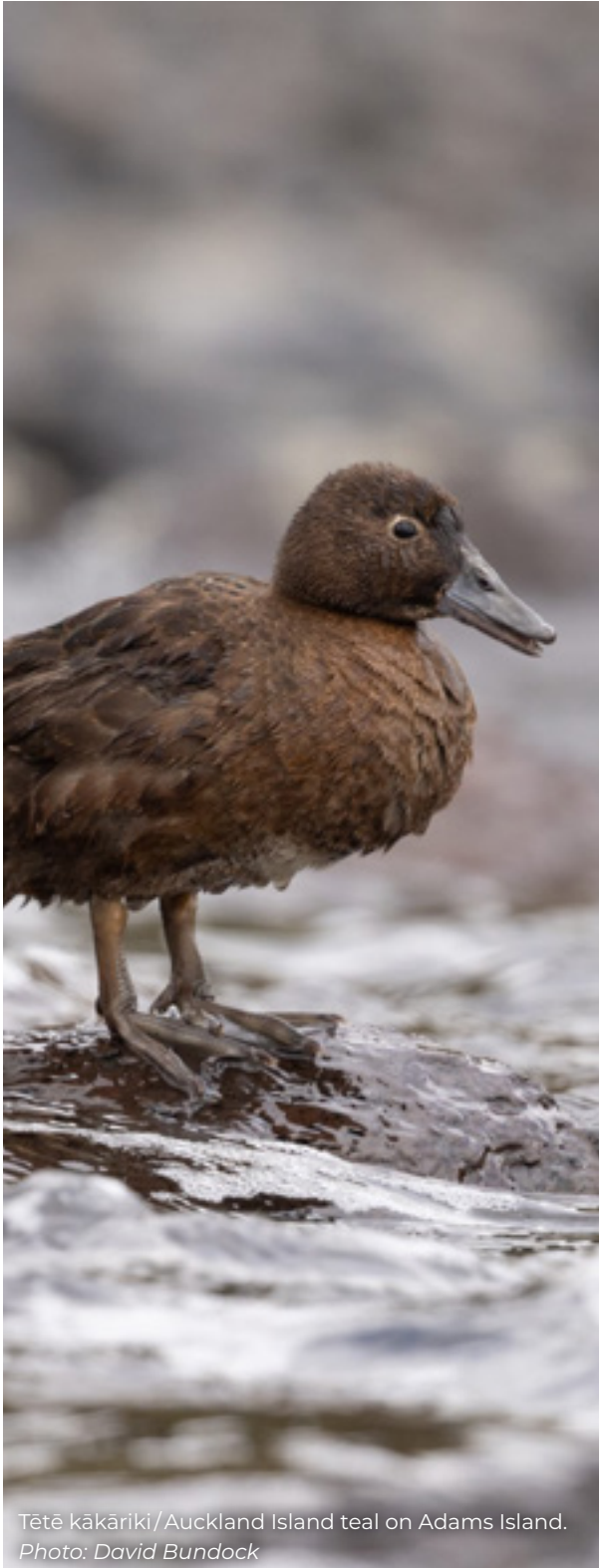
Tētē kākārīki/Auckland Island teal on Adams Island.