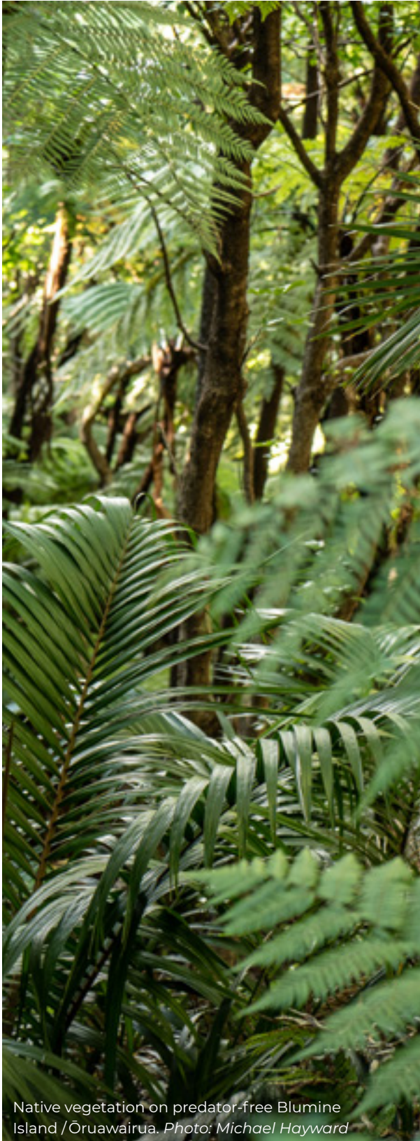
Native vegetation on predator-free Blumine Island / Ōruawairua.