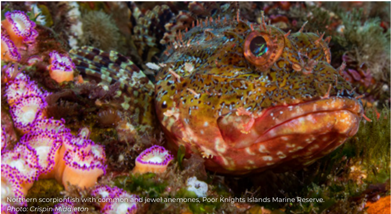
Northern scorpionfish with common and jewel anemones, Poor Knights Islands Marine Reserve.

There is an opportunity to drive greater investment into nature-based solutions to climate change and ecosystem restoration by improving the current evidence base. Essential research to build knowledge of carbon stocks in native forest ecosystems is underway, including the development of new ways to measure carbon storage in forests 8 and the development of new approaches for improving the supply of native trees and establishing new native forests to help with carbon reduction and support biodiversity. 9 Improving the condition and extent of wetlands and peatlands will also help with carbon reduction.