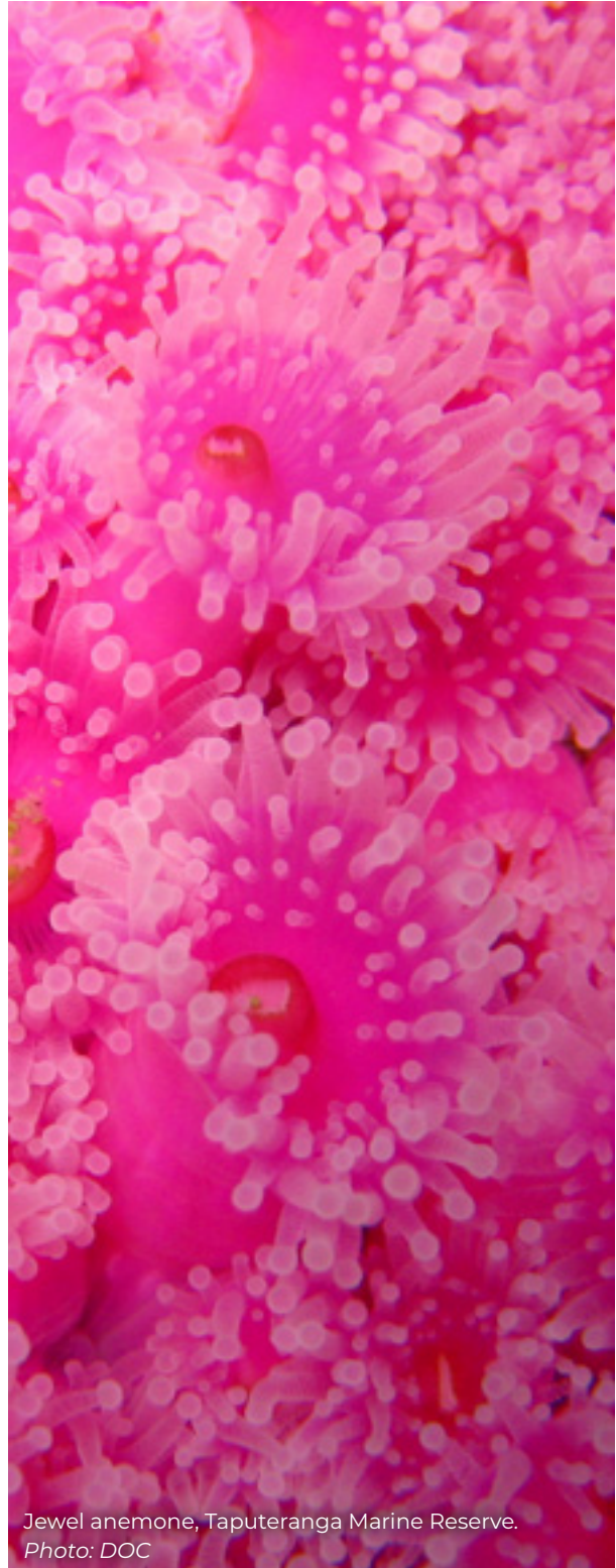
Jewel anemone, Taputeranga Marine Reserve.

The proposed actions are achievable by 2030, have clear accountabilities and have cross-sector support to ensure that we can report on progress and delivery. Development has been informed by early engagement with stakeholders and guidance from the ANZBS Coordinating Group, a steering group which includes representatives from DOC, MPI (Biosecurity New Zealand [BNZ]), MfE, LINZ and regional councils.