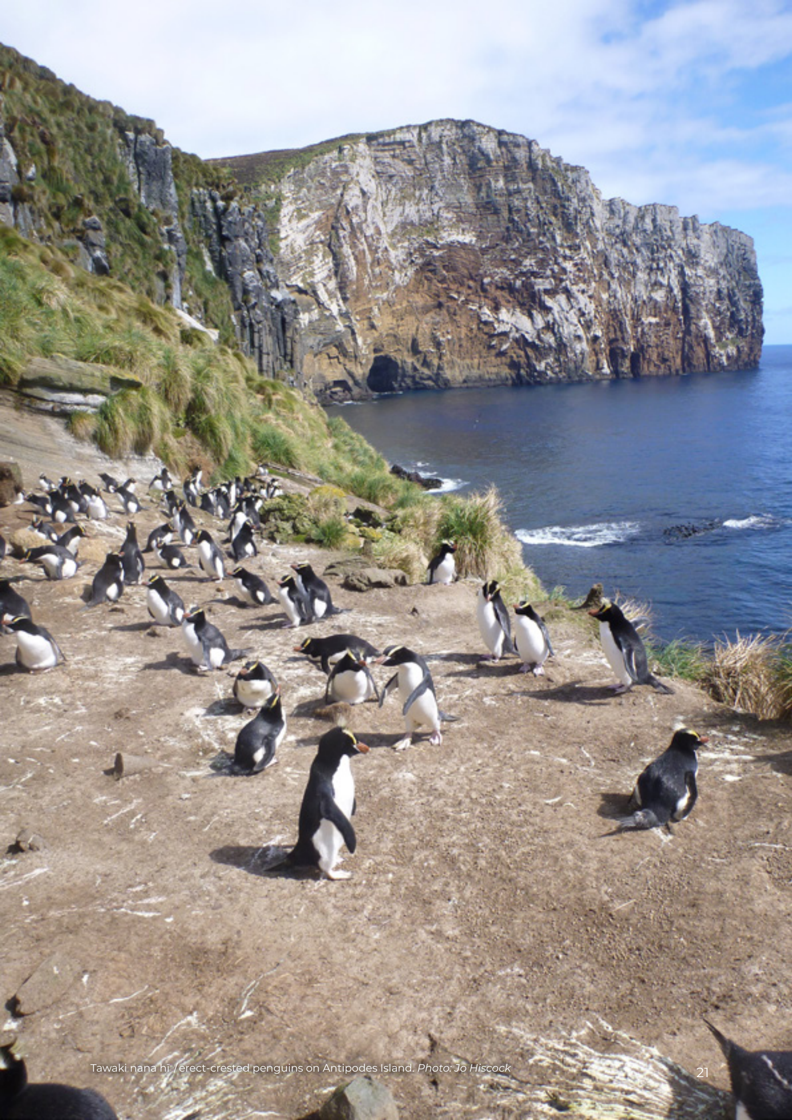
Tawaki nana hi / erect-crested penguins on Antipodes Island.