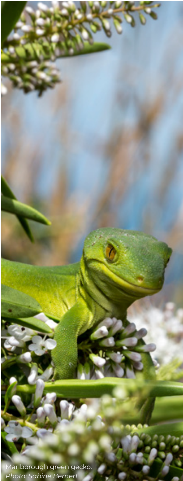
Marlborough green gecko.